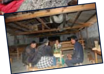
The local Christians gather. • A shy small child takes a moment to look at the camera. • A group of Christians eat a meal in a local church.